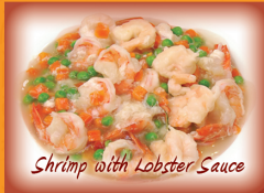
Shrimp with Lobster Sauce