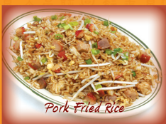
Pork Fried Rice