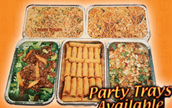
Party Trays Available