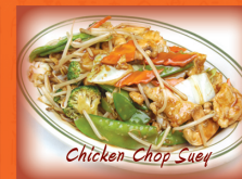
Chicken Chop Suey