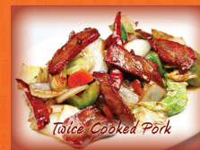
Twice Cooked Pork