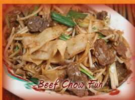
Beef Chow Fun