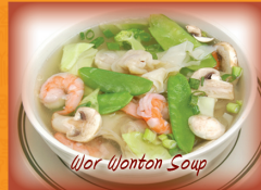
Wor Wonton Soup