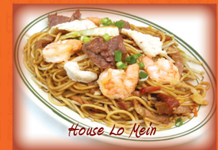
House Lo Mein

MAKE ANY DISHES AS A COMBO FOR JUST $3.95 MORE, INCLUDES SOUP OF THE DAY, A CRAB PUFF AND AN EGG ROLL