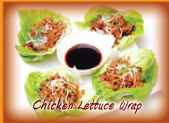
Chicken Lettuce Wrap