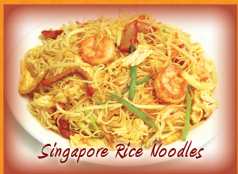
Singapore Rice Noodles